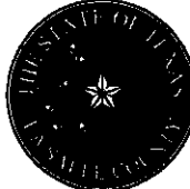
La Salle County