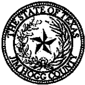
Jim Hogg County